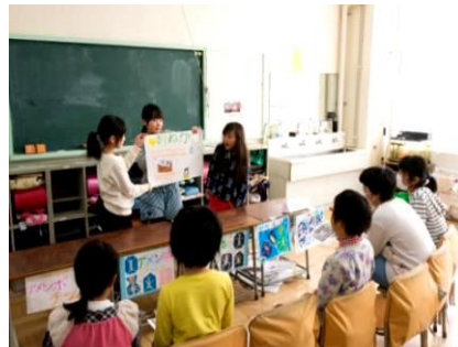
ESD Students' Show